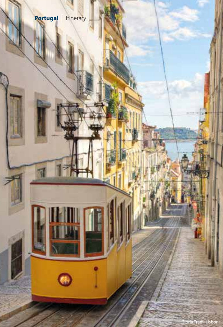
Glória Tram, Lisbon