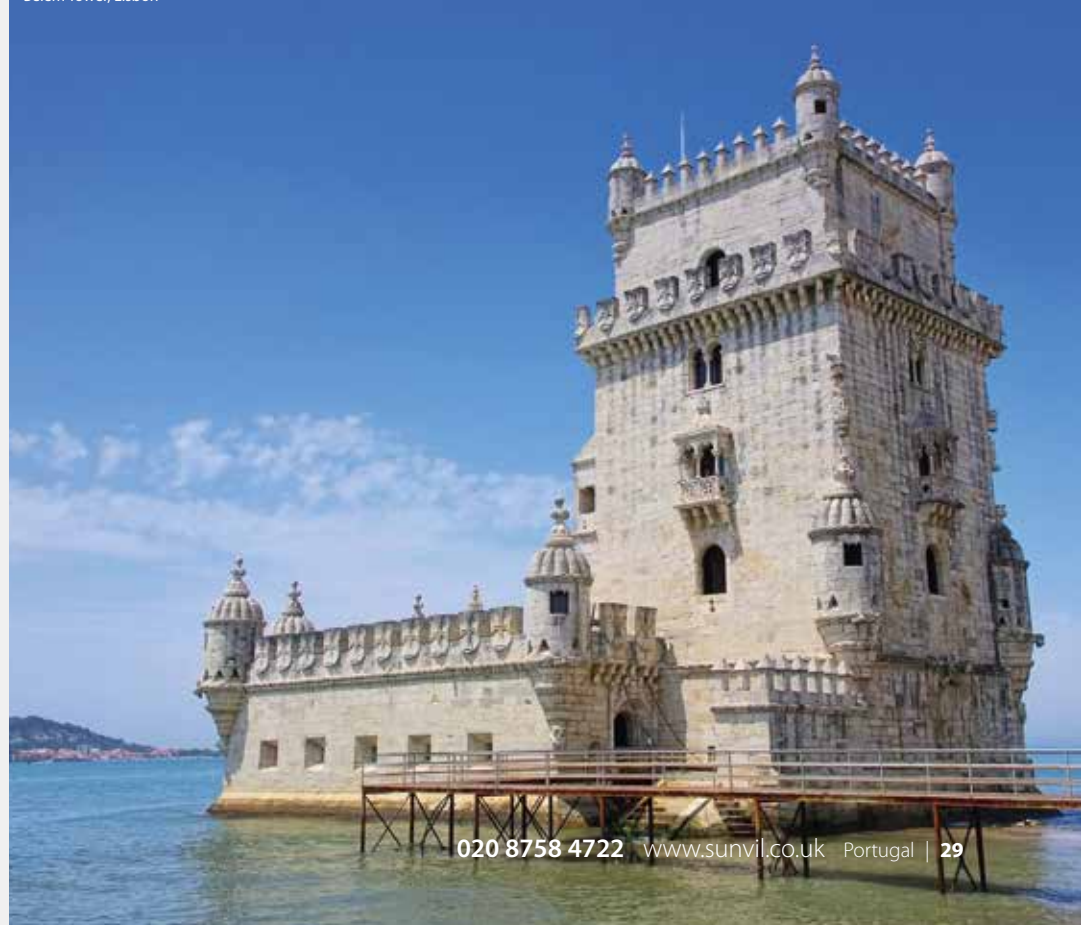
Belém Tower, Lisbon