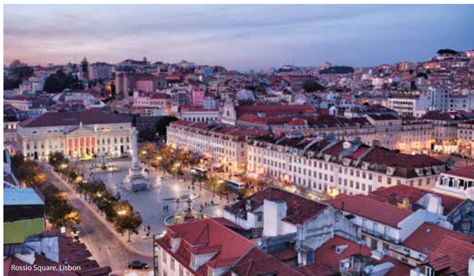
Rossio Square, Lisbon