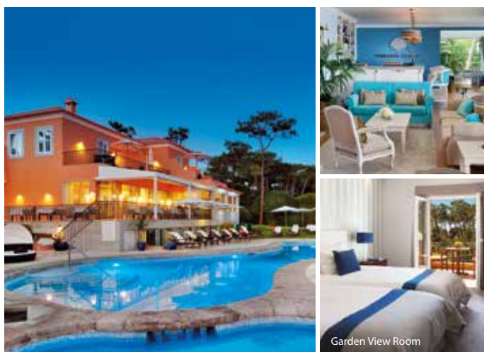
Garden View Room